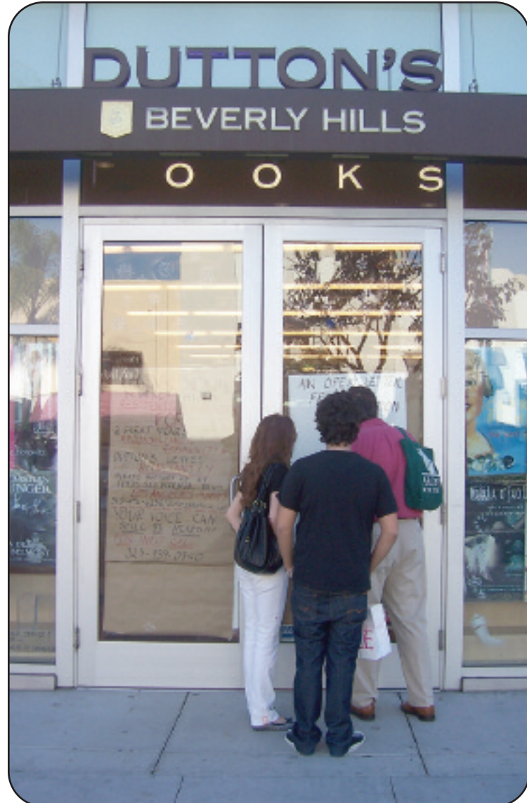
Disappointed customers learn of Dutton's closure and read an open letter to the community posted in the door.