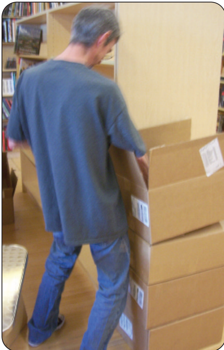
A Dutton's employee loading boxes

But still, rent plus the utilities and proper-