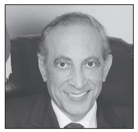
Why did you decide not to run for reelection?

I had made a commitment when I first ran for city council that if I won, I would not run after two terms and that I would also encourage others not to run for more than two terms. I believe after two terms, you should be able to accomplish what you have to do and allow new blood to come in and do their fair share. So as a result, I ran two terms, I won both terms, I accomplished what I had to do, and I think it's time now for others to take on the charge.