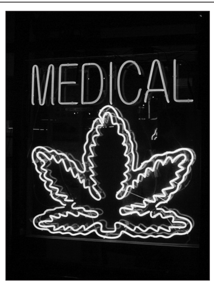
A medical marijuana dispensary on Santa Monica Boulevard in West Hollywood

"School administrators know they can't honestly look parents in the eye and guarantee