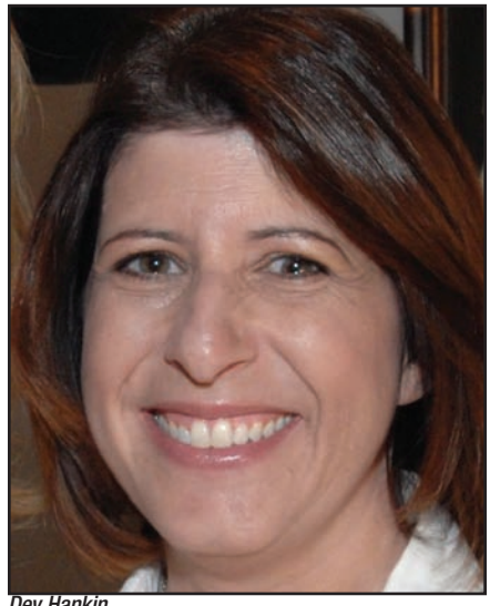
A Weekly Investigation

The Weekly investigated three local school district's education foundations to see how they've weathered the recent financial recession. The findings show the Beverly Hills Education Foundation has some catching up to do if it wants to compete with the incoming donations to comparable districts.