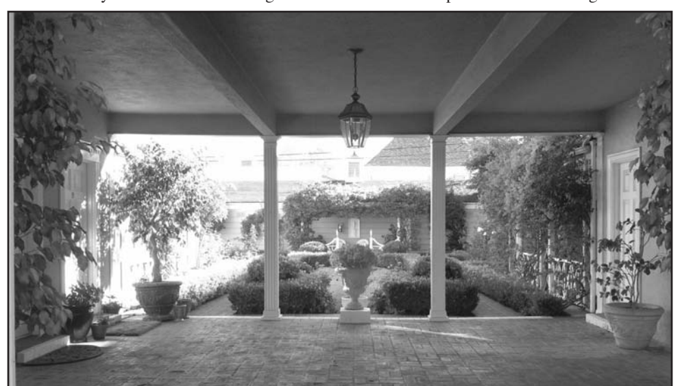
Interior of 9936 Durant Drive today

The city has no official ordinance that protects or preserves historic buildings or icons. It does however have a General Plan that outlines the city's desires and goals to do its best to protect these buildings.