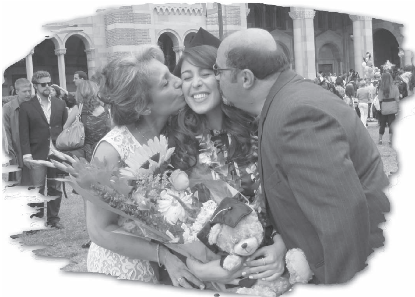
PROUD PARENTS ROYCE HALL