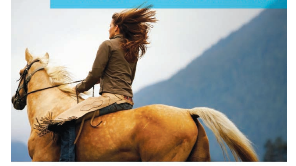
Seminar: Advances in Knee Replacement

How knee replacement can get you back to enjoying life.