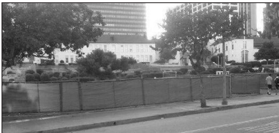
Temporary fences line Beverly High's campus for seismic testing and trenching