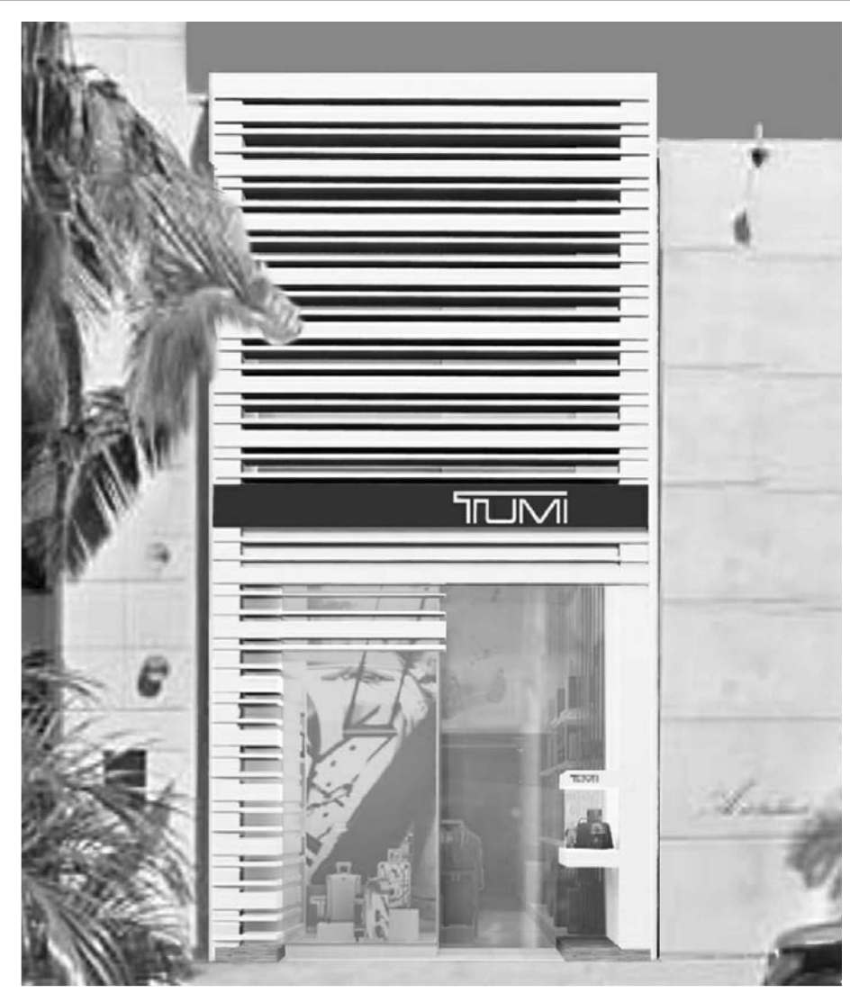
Architectural Commission approves designs for three new Rodeo Drive retail shops

Three new retail shops are coming soon to Rodeo Drive, following approval by the Architectural Commission on Feb. 15.