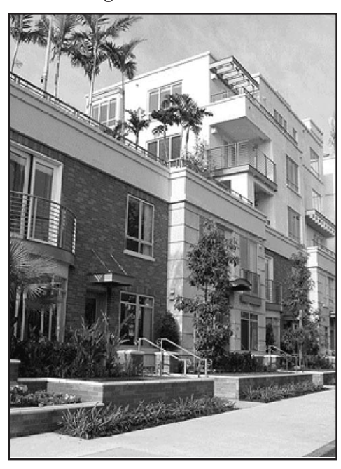
155 North Crescent Drive

Korman Communities announced last month its $85-million acquisition of the property at 155 North Crescent Drive, where The Crescent Beverly Hills' luxury apartments are currently located. The East Coast-based company has announced plans to convert the property from traditional rentals to fully furnished luxury residences and other renovation plans, but no applications have been filed with the City's Planning Division.