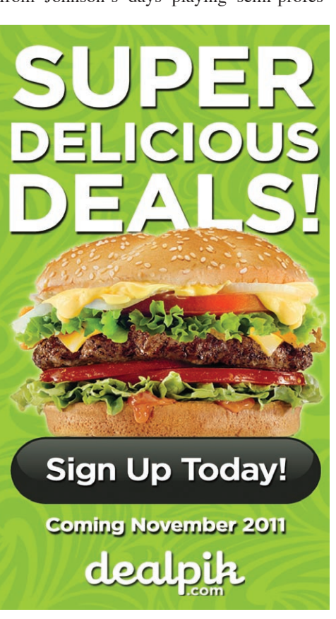
Page 10 • Beverly Hills Weekly