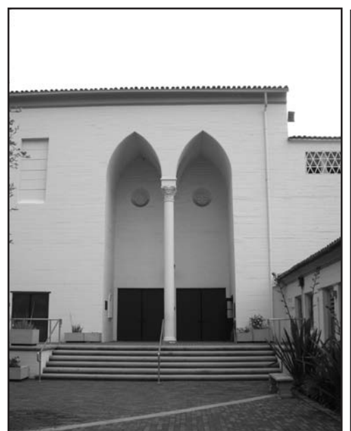
Entrance to Hawthorne's auditorium from the courtvard

"The notion of Building A is that you can't afford to build a building to that degree of quality level today and it has superior aesthetics, superior to even the later buildings [at Hawthorne] that don't have the same level of