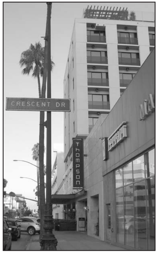
Thompson Beverly Hills, as seen from Wilshire Boulevard

The special-event permits would apply to events scheduled for Sunday through Thursday nights, since the rooftop currently operates until 2 a.m. on Fridays and Saturdays. The hotel, which is located at Wilshire Boulevard and Crescent Drive, would not be permitted to use more than two special-event permits during any single month.