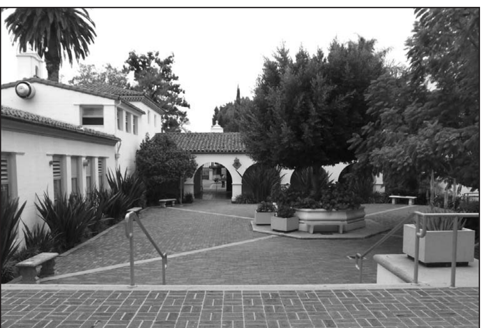
View of the courtyard from Hawthorne's auditorium entrance