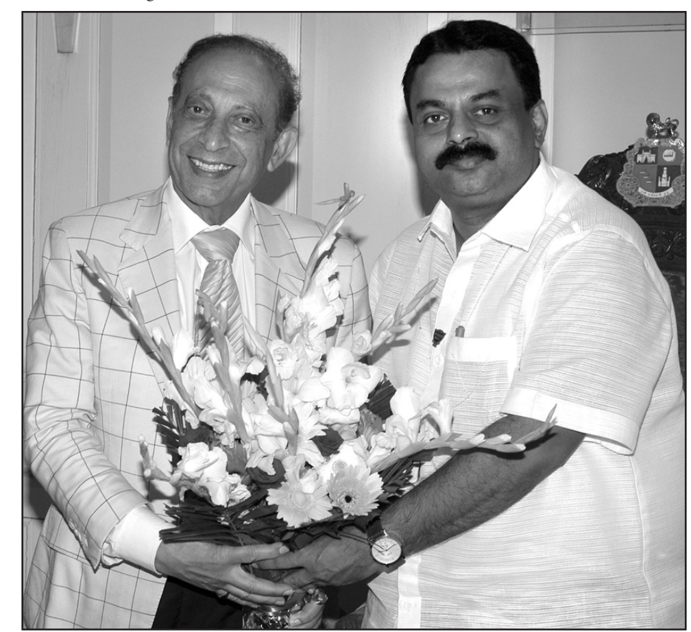
Former Mayor Jimmy Delshad (left) meets Mumbai Mayor Sunil Prabhu

They asked to please send an invitation to the delegation to come, so they can take it to council. They'll come at their own expense to Beverly Hills and if they like it and we