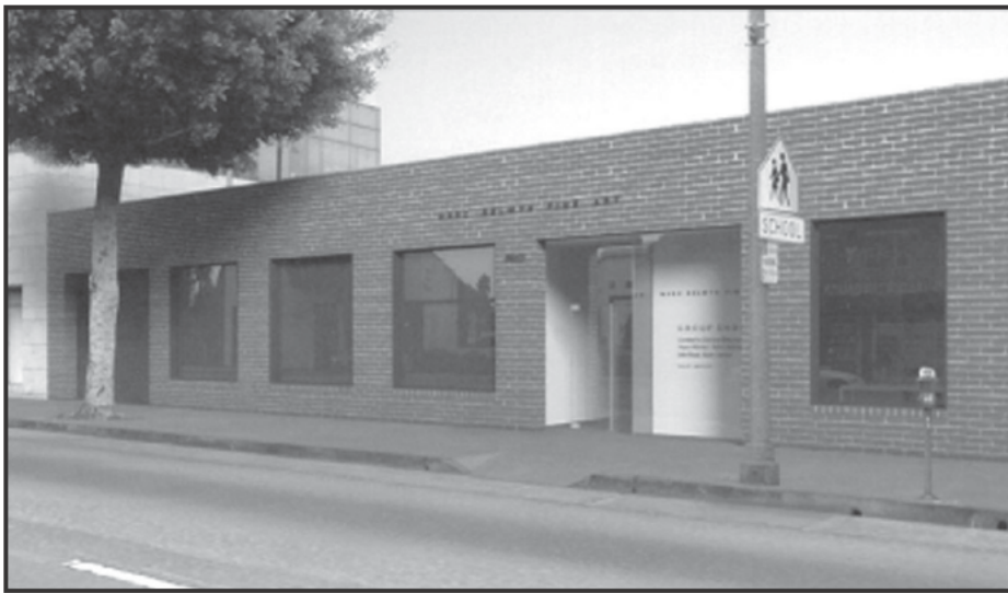
Proposed façade remodel for 9953 South Santa Monica Boulevard