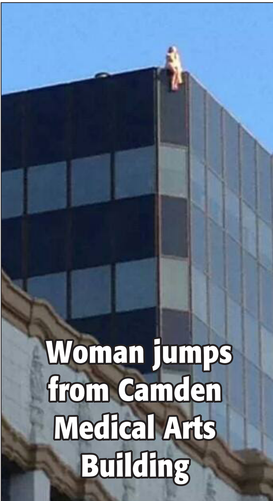
Woman jumps from Camden Medical Arts Building

Issue 747 • January 23, 2014 - January 29, 2014