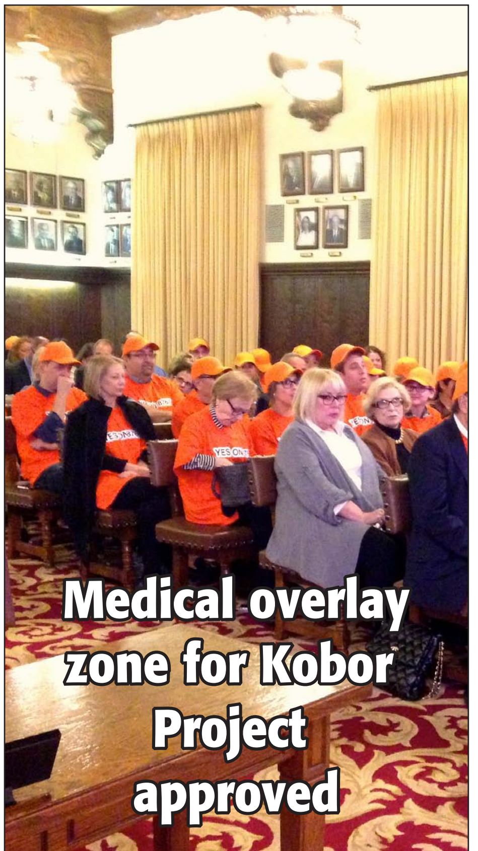
Medical overlay zone for Kobar Project approved