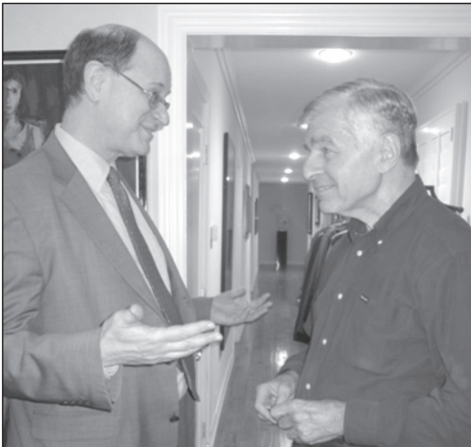
Brad Sherman (left) and Michael Dukakis