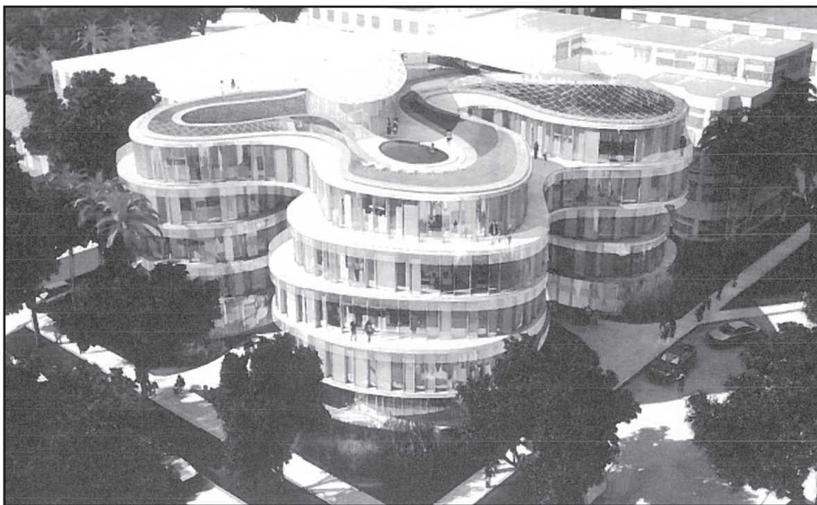
425 – 429 North Palm Drive

"We, generally as a city, have frowned on [six story structures] because it increases the perceived bulk and mass of the structures," Commissioner Craig Corman said. "[The amenities being] pushed back away from the perimeter of the building in almost every