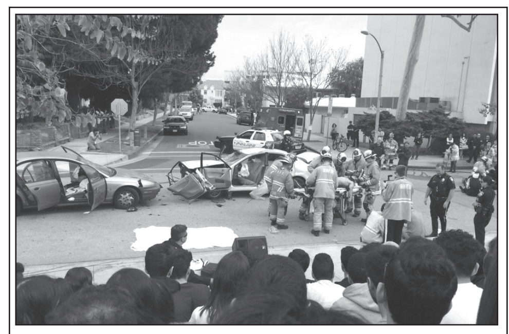
The first half of "Every 15 Minutes" took place last Thursday