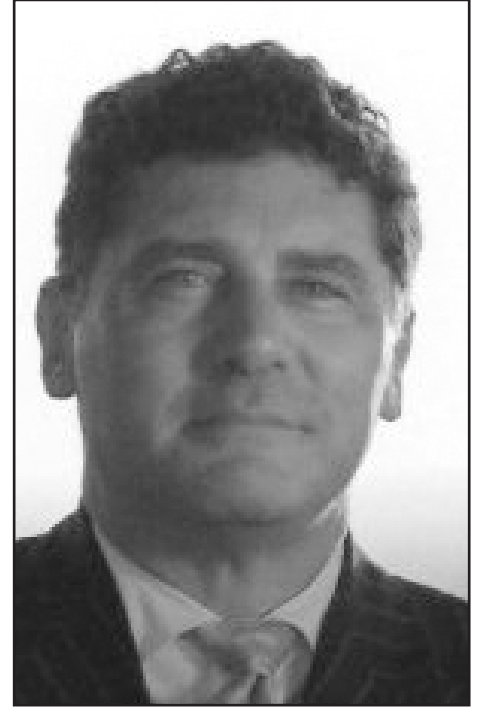
How did you become involved with the Conference and Visitors Bureau?

Incoming Chair of the Conference and Visitors Bureau Board of Directors