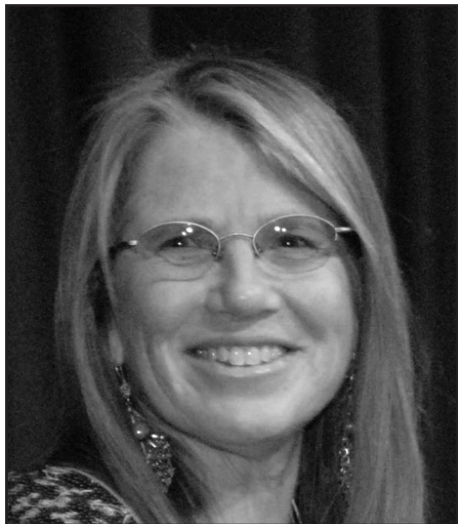
Former Los Angeles Mayor Tom Bradley has been gone almost 20 years. Why did you want to make the documentary?

Co-Producer of Bridging the Divide: Tom Bradley and the Politics of Race