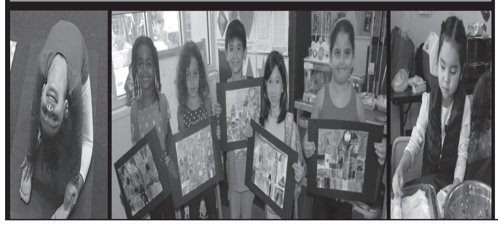
Page 6 • Beverly Hills Weekly