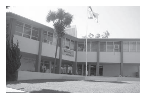
District office on Lasky Drive

selling the District office property on Lasky Drive, according to the staff report for Thursday's Board meeting.