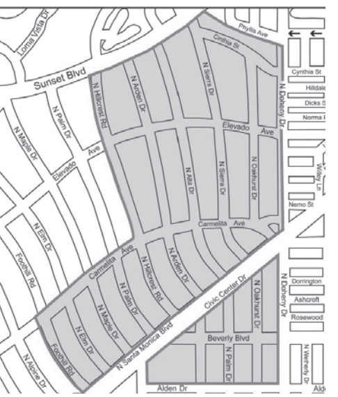
Except by permit, the street blocks within the shaded area will be restricted Halloween night

In response to resident requests, the City is establishing "No Parking, Except