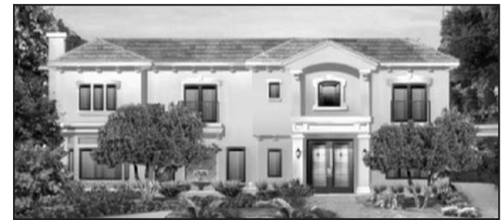
705 North Camden Dr., proposed rendering

"I think the façade is very well-propor-