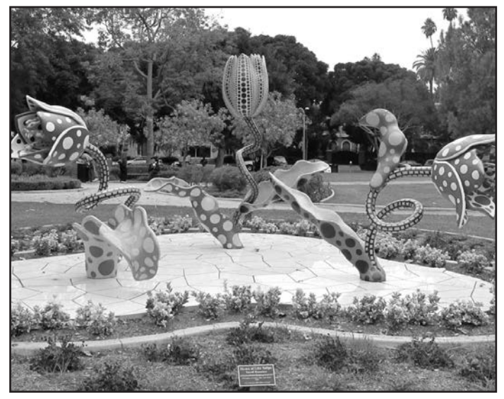
briefs cont. from page 4

the project, due to its "sensitive nature."