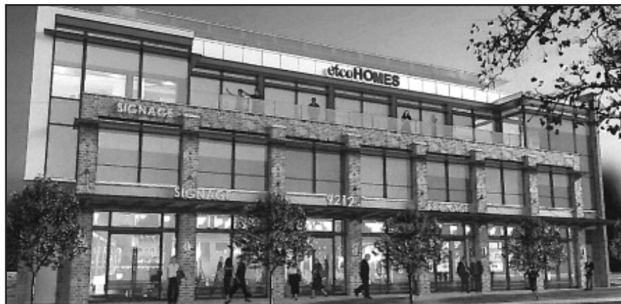
Project proposed for 9206 and 9212 Olympic Blvd.