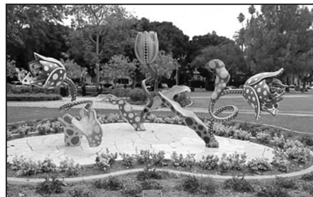
Yayoi Kusama’s Hymn of Life: Tulips sculpture at Beverly Gardens Park