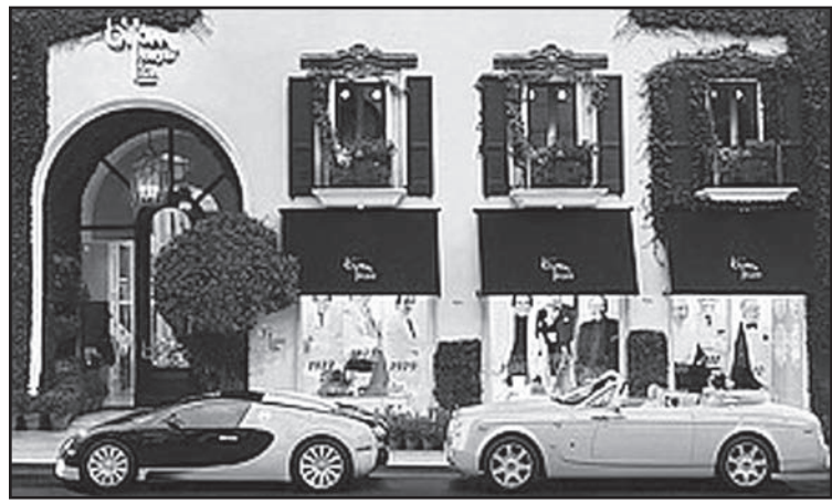
420 N Rodeo Dr