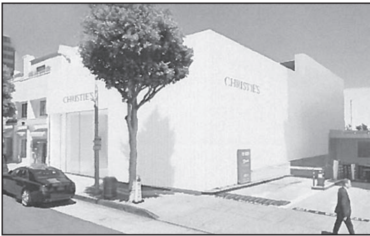
Proposed site street frontage 332-336 North Camden Dr