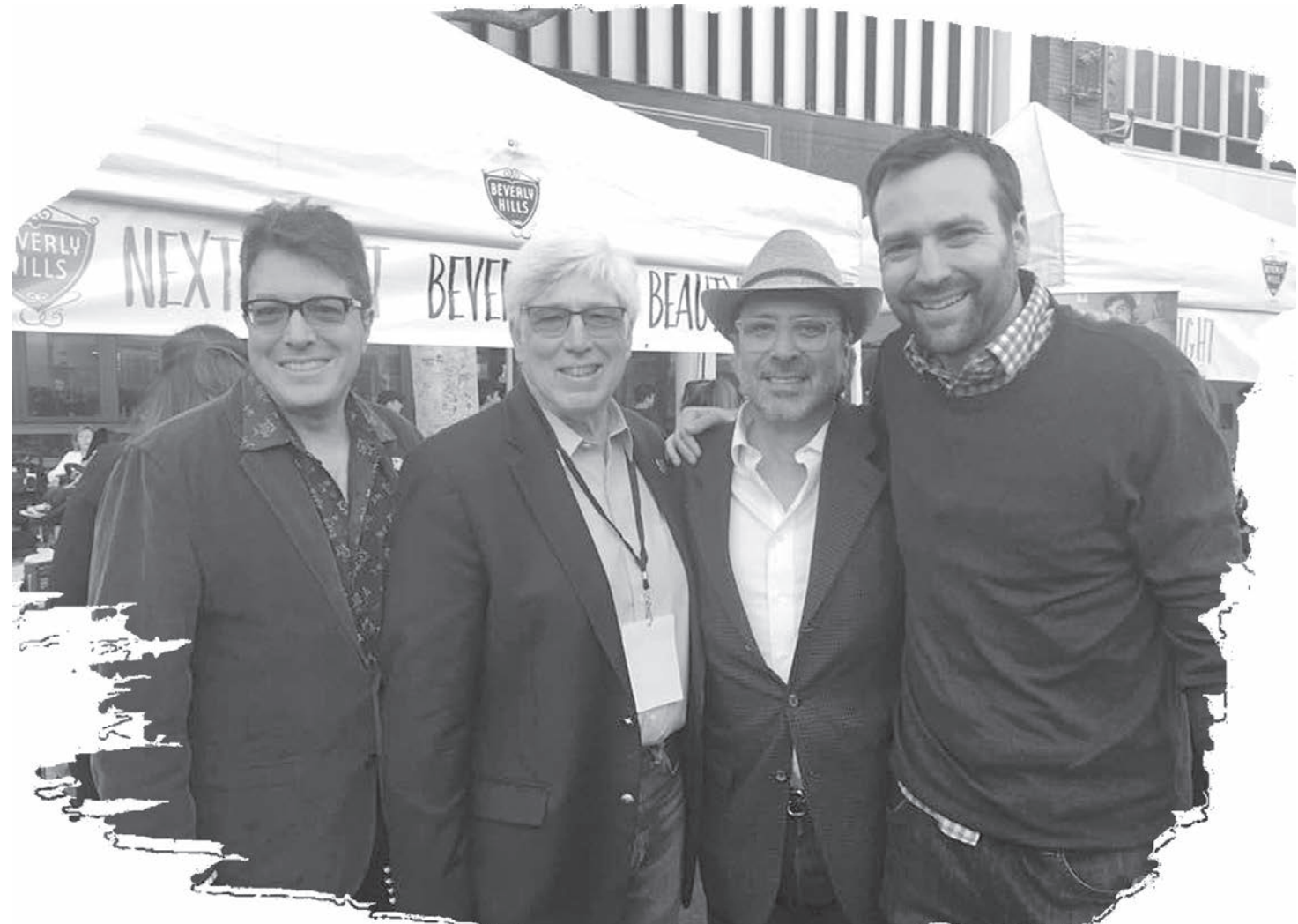
NIGHT ON THE TOWN! SOUTH BEVERLY DRIVE