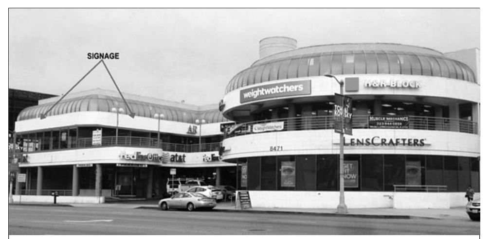
8471 Beverly Boulevard, Los Angeles CA 90048 For Lease - Prime Second Floor Retail

Approximately 99,598 cars pass through the intersection of Beverly and La Cienega Boulevards. $200,000 in improvements, within the last 30 days. Venetian plastered walls, engineered flooring, R.F.I.D. locking system to all doors exterior and interior. Also includes a kitchen. Parking for 100+ cars, free after 7:00 PM. Space is available for 8:00 AM to 6:00 PM, 7 days a week.