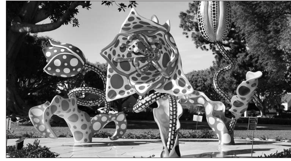
Yayoi Kusama's Hymn of Life: Tulips sculpture at Beverly Gardens Park