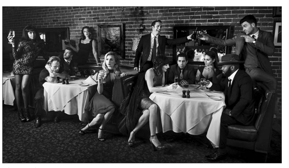
Cast of "For the Record: Scorsese" at La Scala Beverly Hills