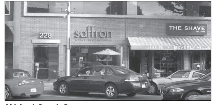
228 South Beverly Dr.

The Board unanimously agreed to move forward with the plans to remodel the Hawthorne auditorium and submit the proposal, including the scope changes, to DSA.