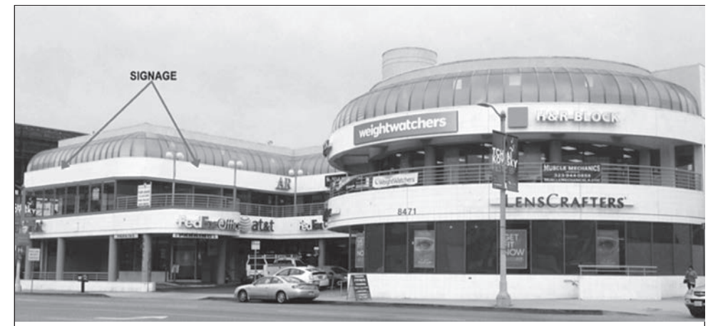
8471 Beverly Boulevard, Los Angeles CA 90048 For Lease or JV - Open to any ideas to utilize the space of 2200 square feet, no retail . Month to month availability.

Approximately 200,000 cars pass through the intersection of Beverly and La Cienega Boulevards daily. $200,000 in improvements within the last 30 days. Venetian plastered walls, engineered flooring, R.F.I.D. locking system to all doors exterior and interior. Also includes a kitchen. Parking for 100+ cars, free after 7:00 PM. Space is available for 8:00 AM to 6:00 PM, 7 days a week.