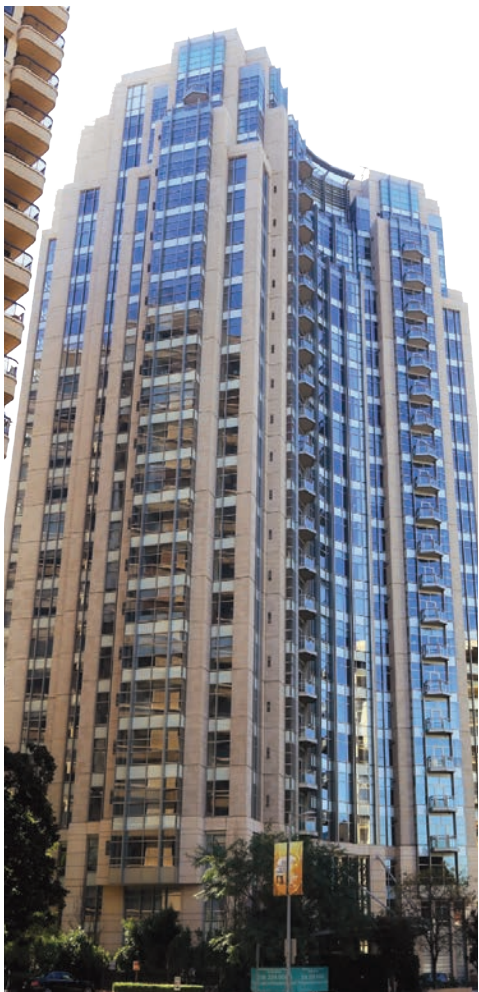
Taller than most buildings on the Wilshire corridor