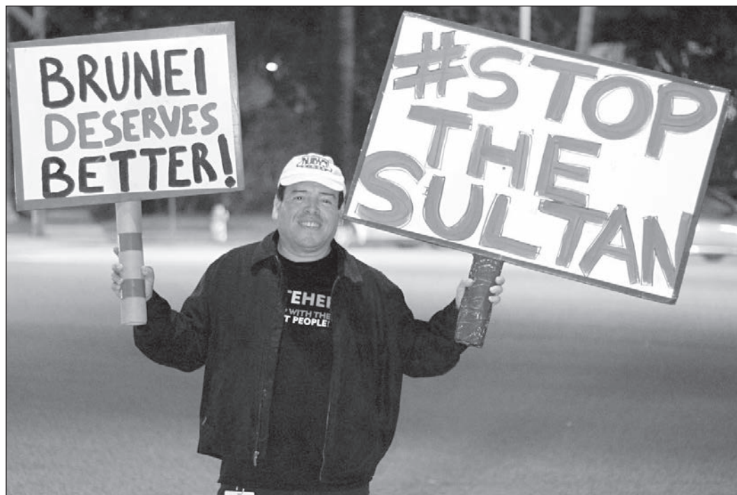
2014 protest against Beverly Hills Hotel