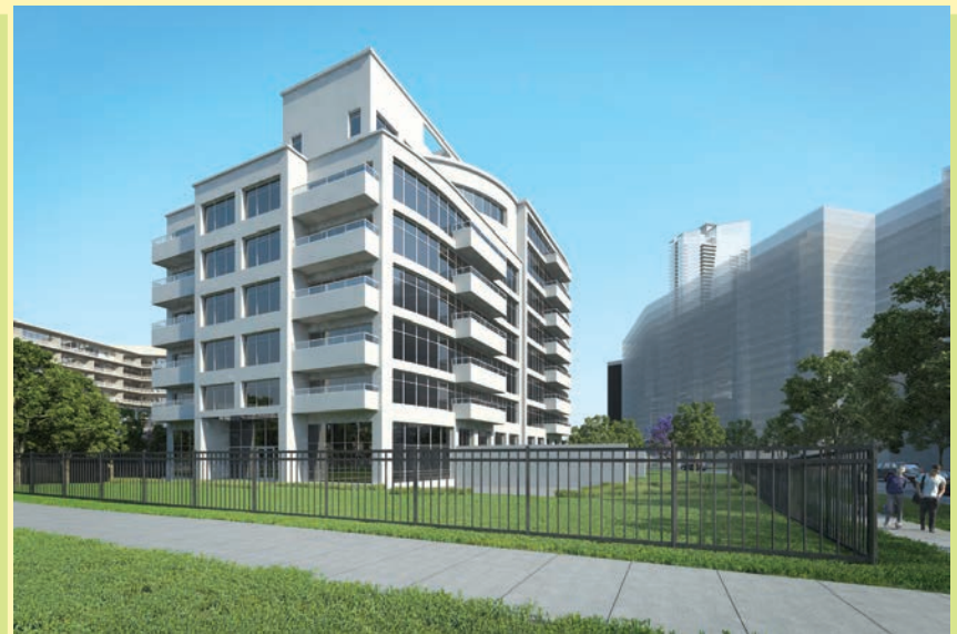
WITH A NO VOTE ON HH: TWO BUILDINGS — NO PARK