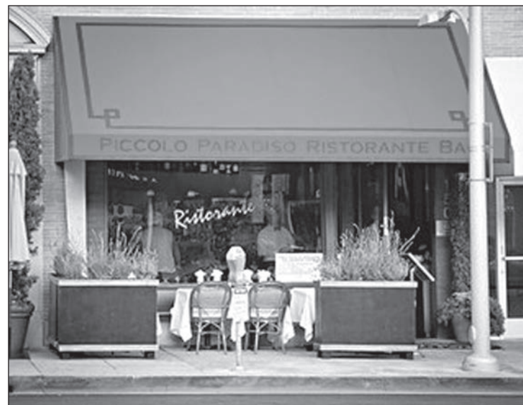
150 South Beverly Drive

which is a home-made penne with mushroom, sausages and truffle. We're also known for fish like the Branzino. A lot of other restaurants have the Branzino but usually they do it filet, we do the whole fish. Before, when we had less people we used to clean it at the table. It's a little challeng-