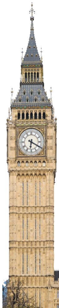
Taller than Big Ben