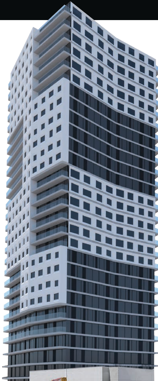
Measure HH Skyscraper