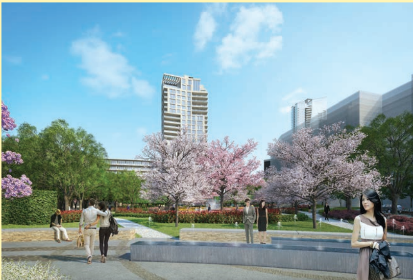
WITH YOUR YES VOTE ON HH: 1.7 ACRE GARDEN AND PARK WITH ONE BUILDING