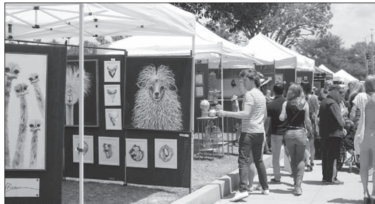
2015 Beverly Hills artSHOW

The fall artSHOW will return to Beverly Hills for its 44th year on Oct. 15 and 16 from 10:00 a.m. to 5:00 p.m. at the Beverly Gardens Park.