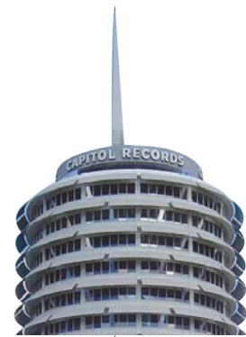
More than 1.5 times taller than the Capitol Records building in Hollywood