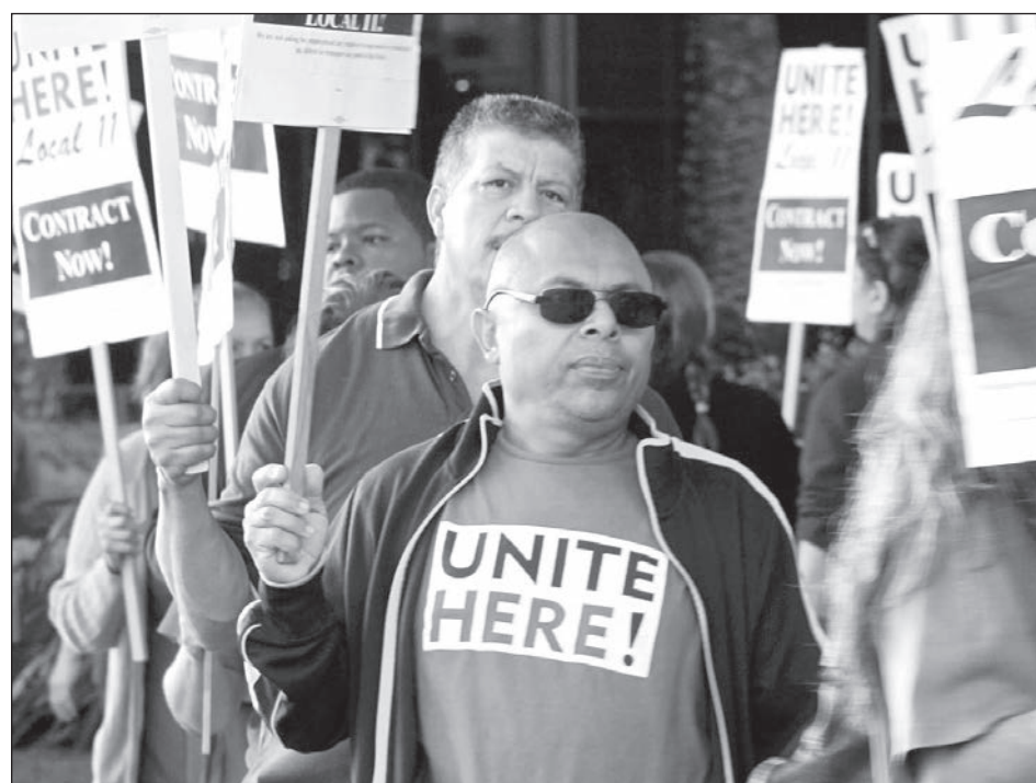
UNITE HERE protest