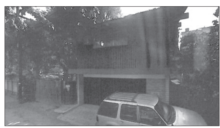
472 S Spalding Dr. alley elevation (accessory structure); source: Feb. 23 staff report available on beverlyhills.org

ed additional landscaping, increased setback of the deck from the neighbor's property line and a time limit set should the property owner decide to rent out the accessory dwelling unit.