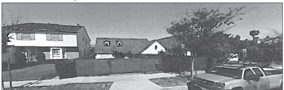
472 S Spalding Dr. street elevation; source: Feb. 23 staff report available on beverlyhills.org

Other conditions for approval also includ-