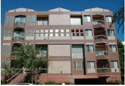
120 S. Crescent Drive #302