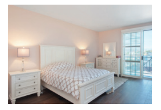
9880 Vidor Drive #303