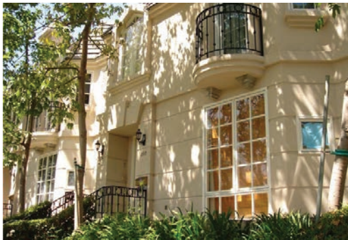
309 Almont Drive