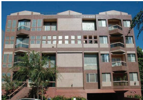
120 S. Crescent Drive #302