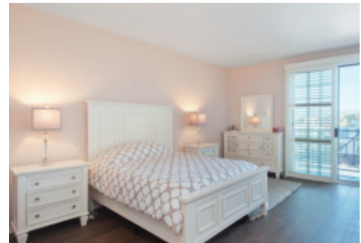
9880 Vidor Drive #303