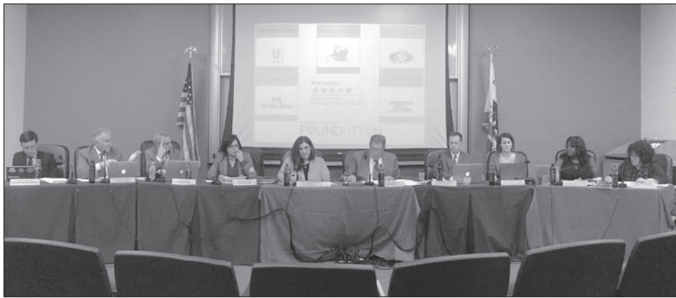
Board of Education and administrative staff at Tuesday's regular meeting in the Cherney lecture hall