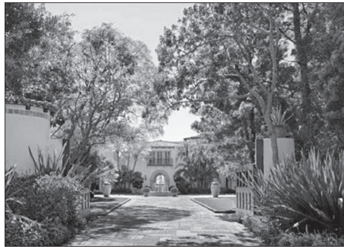
1146 Tower Road

The Planning Commission was expected to review a permit application for the addition of approximately 2,461 square feet to 1146 Tower Road during its meeting on Thursday, March 9.