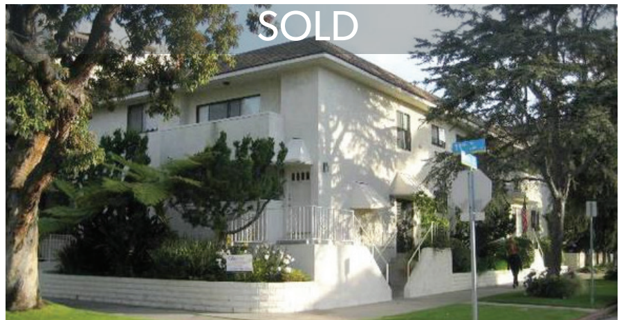
1105 Idaho Ave. #208 | Santa Monica On the market 214 days with previous brokers!