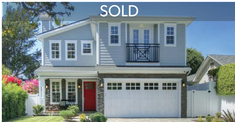
639 N. Sierra Bonita Ave | West Hollywood On the market 271 days with previous broker!