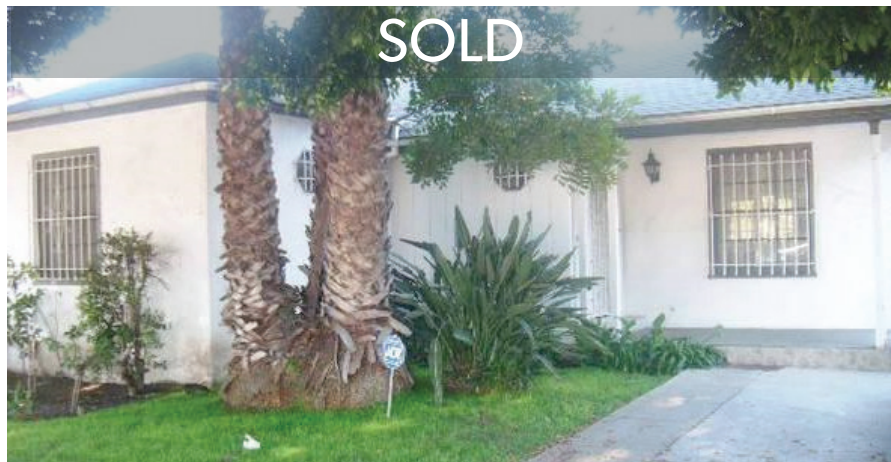
316 N. Crescent Heights | Beverly Center On the market 859 days with previous brokers!