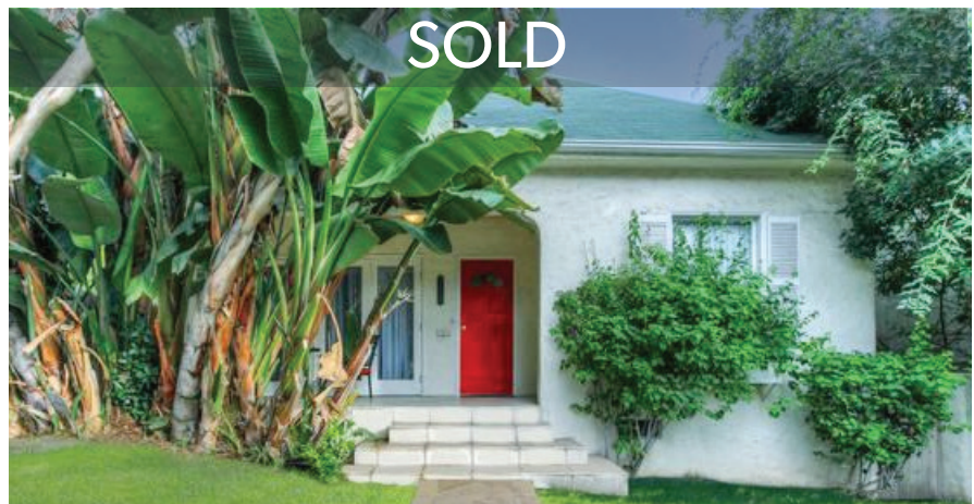
1006 Hancock Ave | West Hollywood On the market 63 days with previous broker!