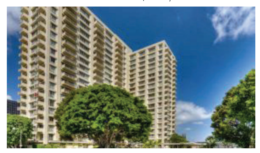
2170 Century Park East #1406 | Century City/Westwood Last listed at $749,000