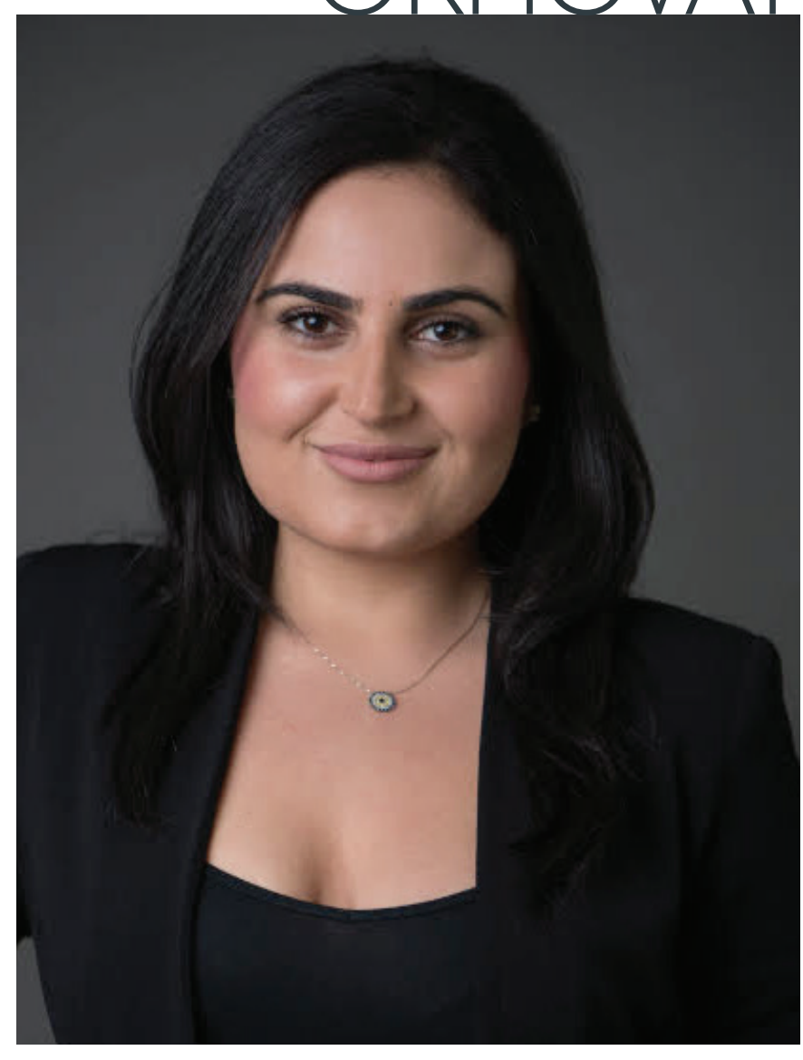
Proud Beverly Hills High and Hawthorne Alumna