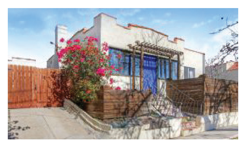
7569 Waring Ave | Los Angeles Last Listed at $1,595,000