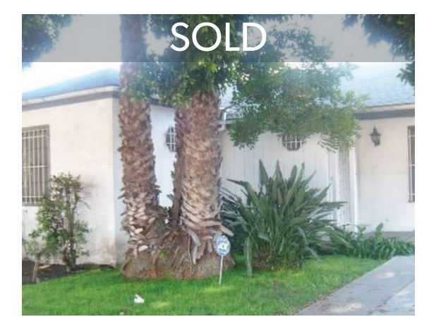
316 N. Crescent Heights | Beverly Center On the market 859 days with previous brokers!