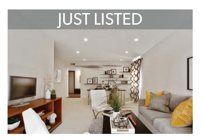
6728 Hillpark Drive #308 | Hollywood Hills Offered at $459,000