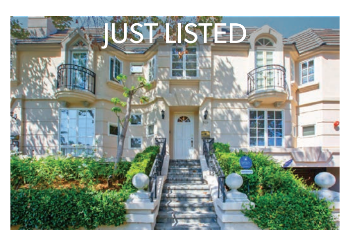
309 North Almont Drive | Beverly Hills Offered at $1,249,000

Hawthorne Graduate & Beverly Hills High School Alumna