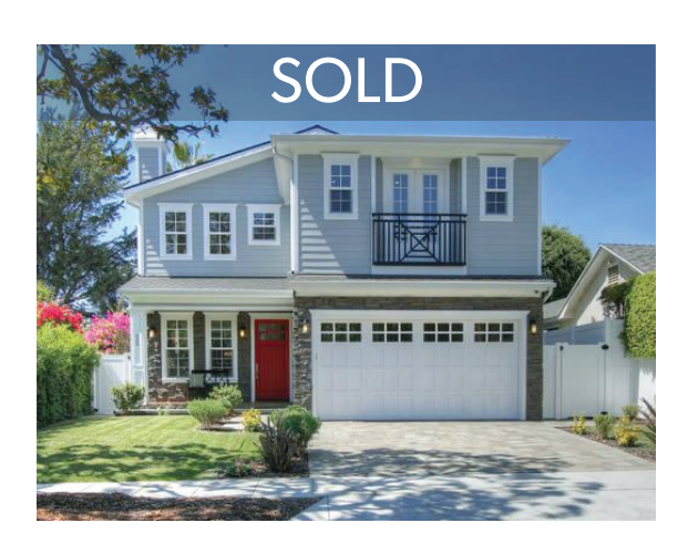
639 N. Sierra Bonita Ave | West Hollywood On the market 271 days with previous broker!