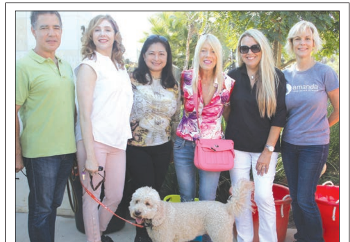
Dog Park Celebrates First Anniversary

To become a National Merit Scholarship Finalist, students must submit an application detailing their academic record, school and community activities, leadership abilities, employment, honors and awards received. Semifinalists must also be endorsed by a