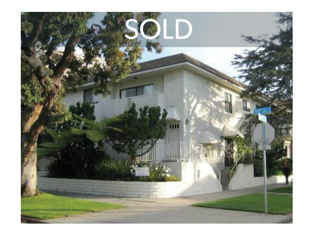
1105 Idaho Ave. #208 | Santa Monica On the market 214 days with previous brokers!