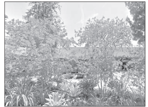
430 Dabney Lane (Foliage owner)

On September 14, the owner of 410 Chris Place withdrew a previously submitted request for a View Restoration Permit