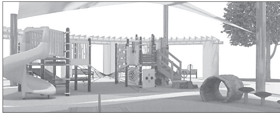
Proposed design rendering

Staff notified residents within 2,000 feet of the park of Tuesday's commis-