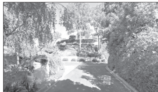
1200 block of Lago Vista