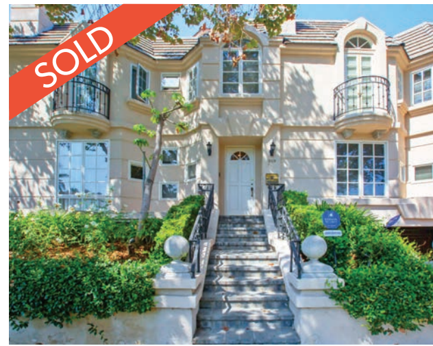
309 Almont | Beverly Hills Listed at $1,249,000 | Sold for $1,425,000