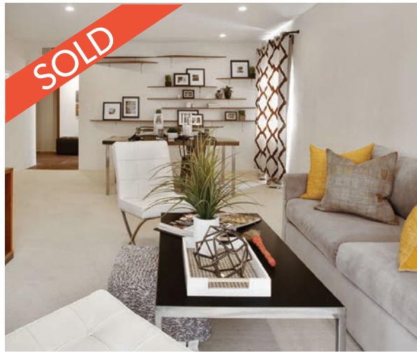
6728 Hillpark | Hollywood Hills Listed at $459,000 | Sold for $495,000 On the market 129 days with previous broker