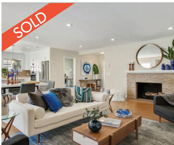
12420 Albers | Valley Village Listed at $998,000 | Sold for $1,051,000 On the market for 5 months with previous broker