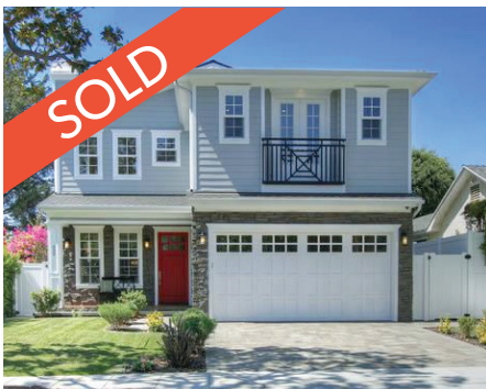
639 N. Sierra Bonita | West Hollywood On the market 271 days with previous broker!