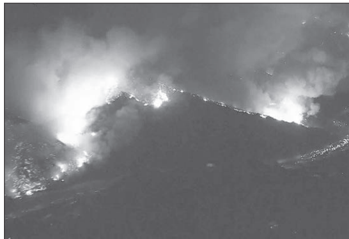
Santa Monica Mountain National Recreation Area ablaze