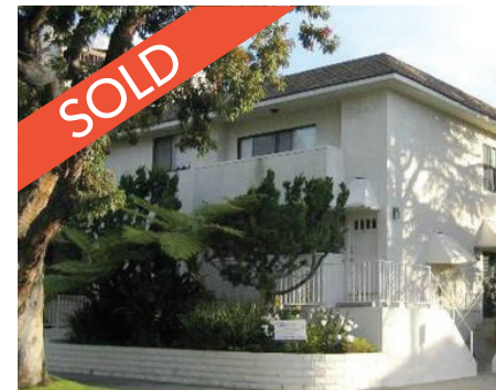
1105 Idaho #208 | Santa Monica On the market 214 days with previous brokers!

WANT A PROFESSIONAL EVALUATION OF YOUR PROPERTY?