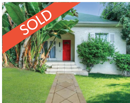
1006 Hancock | West Hollywood On the market 63 days with previous broker!