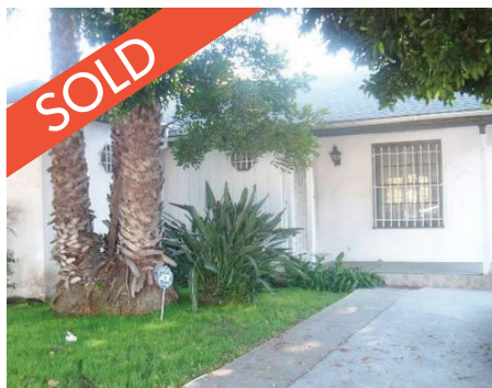
316 N. Crescent Heights | Beverly Center On the market 859 days with previous brokers!