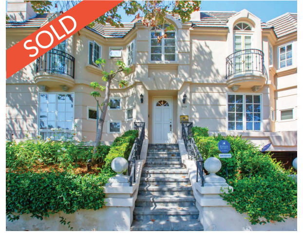
309 Almont | Beverly Hills Listed at $1,249,000 | Sold for $1,425,000