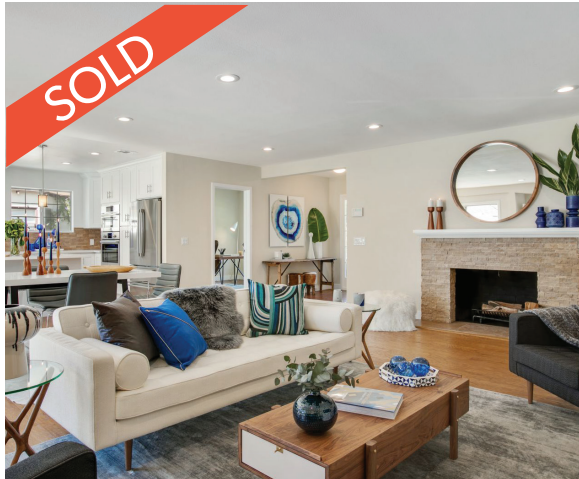
12420 Albers | Valley Village Listed at $998,000 | Sold for $1,051,000 On the market for 5 months with previous broker