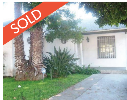
316 N. Crescent Heights | Beverly Center On the market 859 days with previous brokers!