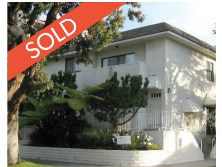
1105 Idaho #208 | Santa Monica On the market 214 days with previous brokers!

WANT A PROFESSIONAL EVALUATION OF YOUR PROPERTY?