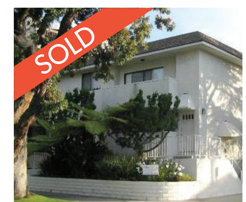
1105 Idaho #208 | Santa Monica On the market 214 days with previous broke