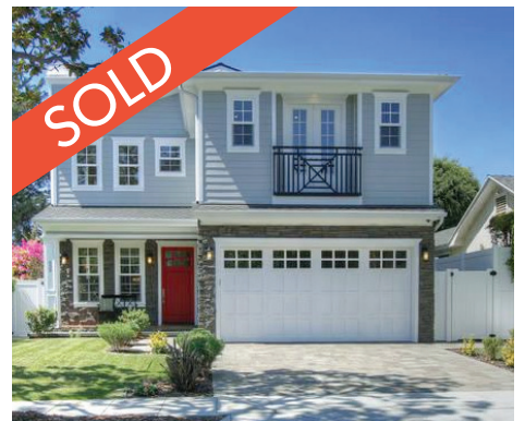
639 N. Sierra Bonita | West Hollywood On the market 271 days with previous broker!