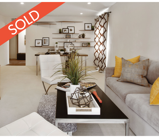
6728 Hillpark | Hollywood Hills Listed at $459,000 | Sold for $495,000 On the market 129 days with previous broker