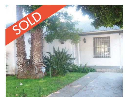
316 N. Crescent Heights | Beverly Center On the market 859 days with previous brokers!