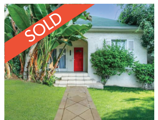
1006 Hancock | West Hollywood On the market 63 days with previous broker!