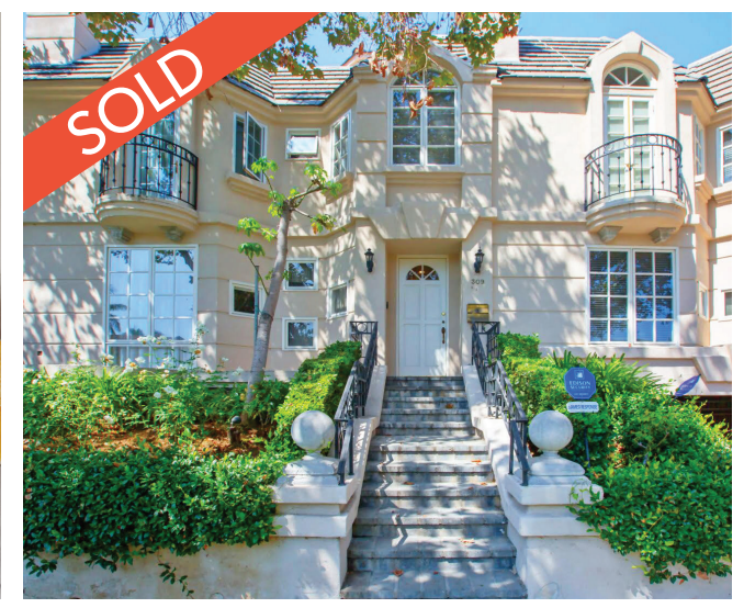
309 Almont | Beverly Hills Listed at $1,249,000 | Sold for $1,425,000