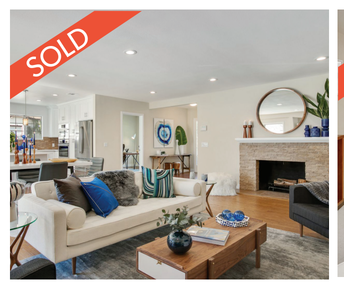
12420 Albers | Valley Village Listed at $998,000 | Sold for $1,051,000 On the market for 5 months with previous broker