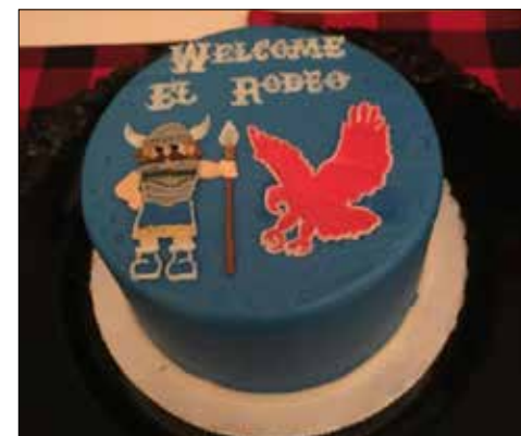
Cake celebrating the unification of Hawthorne and El Rodeo

planned opportunities for parents and teachers from both schools to build relationships, something both the Beverly Hills Unified School District and the PTA Council are sure is key to a successful reconfiguration. Other events that are currently in the works, such as a school carn-