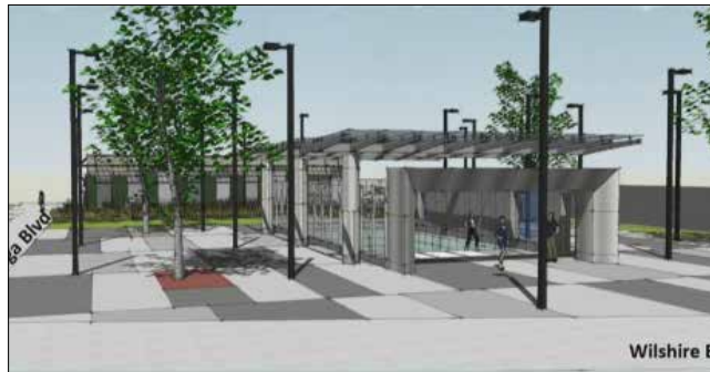
Wilshire/La Cienega Station Schematic

At its last meeting on December 20, the Beverly Hills Strategic Planning Committee was presented with preliminary ideas