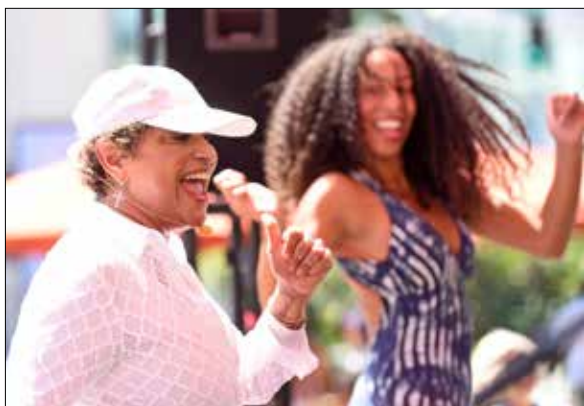
Debbie Allen (left) teaching a dance lesson at The Wallis

as an Art Director for films and commercials and as an EFX artist can be seen in many films including Armageddon , Con-Air , Flubber , Mighty Joe Young , Kundun and Tim Burton's Planet of the Apes , the performance is sure to stun.