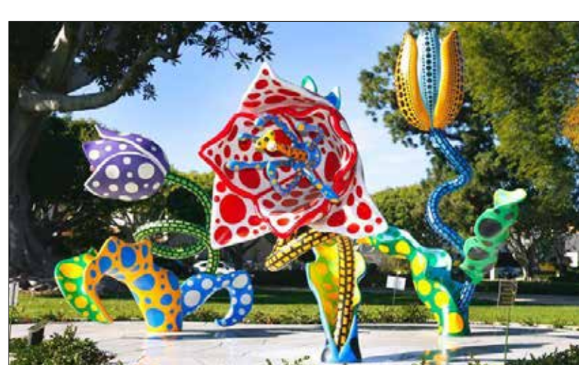
Hymn of Life: Tulips

The studio claimed to be satisfied with a metal sculpture and a five percent reduction, a proposal that stemmed from the fact that the piece has weathered visible