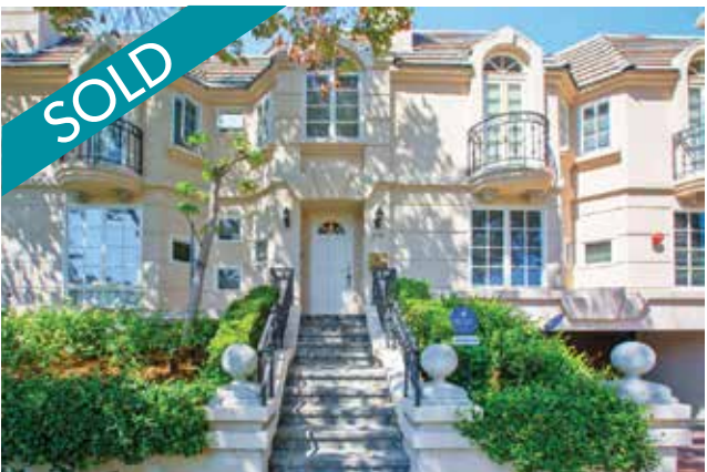
12420 Albers | Valley Village Listed at $998,000 | Sold for $1,051,000 On the market for 5 months with previous broker