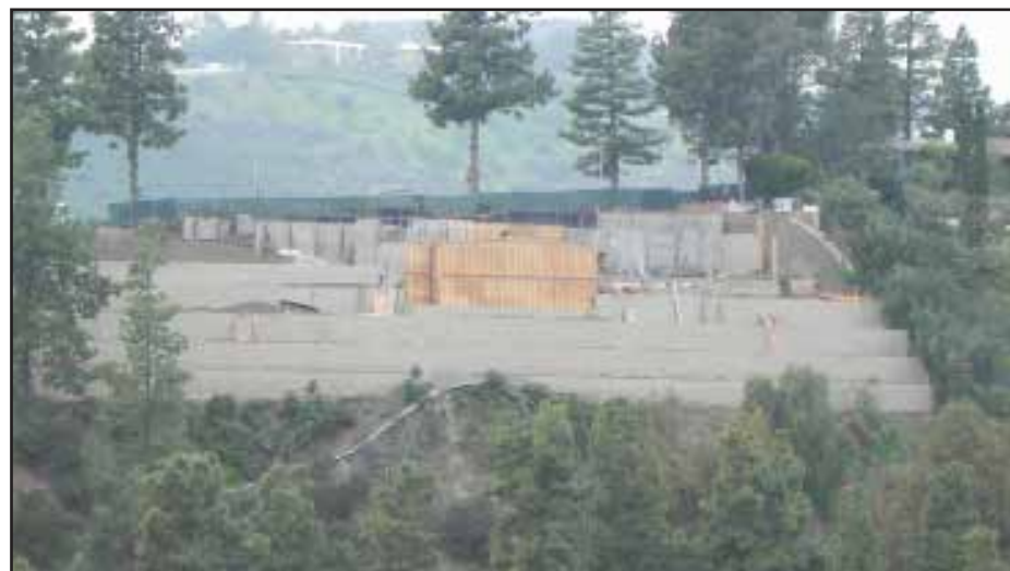
Retaining wall in the Hillside area