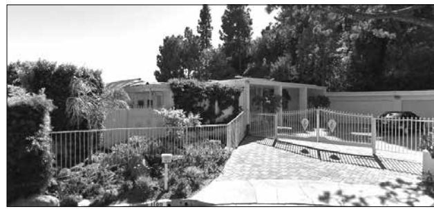
1111 Maytor Place

sued the 1100 Maytor Place property owner an order requiring compliance with the City's hedge height regulations by November 16, 2017. The foliage owner's attorney subsequently requested an extension to the compliance order and the City granted an extension through January 16.