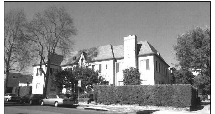
157 South Crescent Drive

According to the staff report, “minimal changes” have occurred to the exterior appearance of the property allowing it to retain “substantial integrity” from its pe-