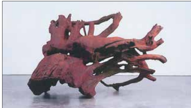
Ai Weiwei’s Roots