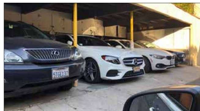
letters cont. on page 3

This is a photograph (see below) showing the cars parked at the apartment build-