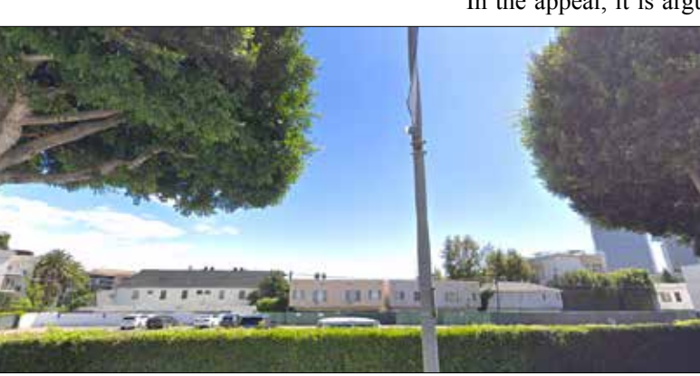
9908 South Santa Monica Boulevard

On Tuesday, the Beverly Hills City Council voted unanimously to enter into development agreement negotiations with the applicant attempting to construct a