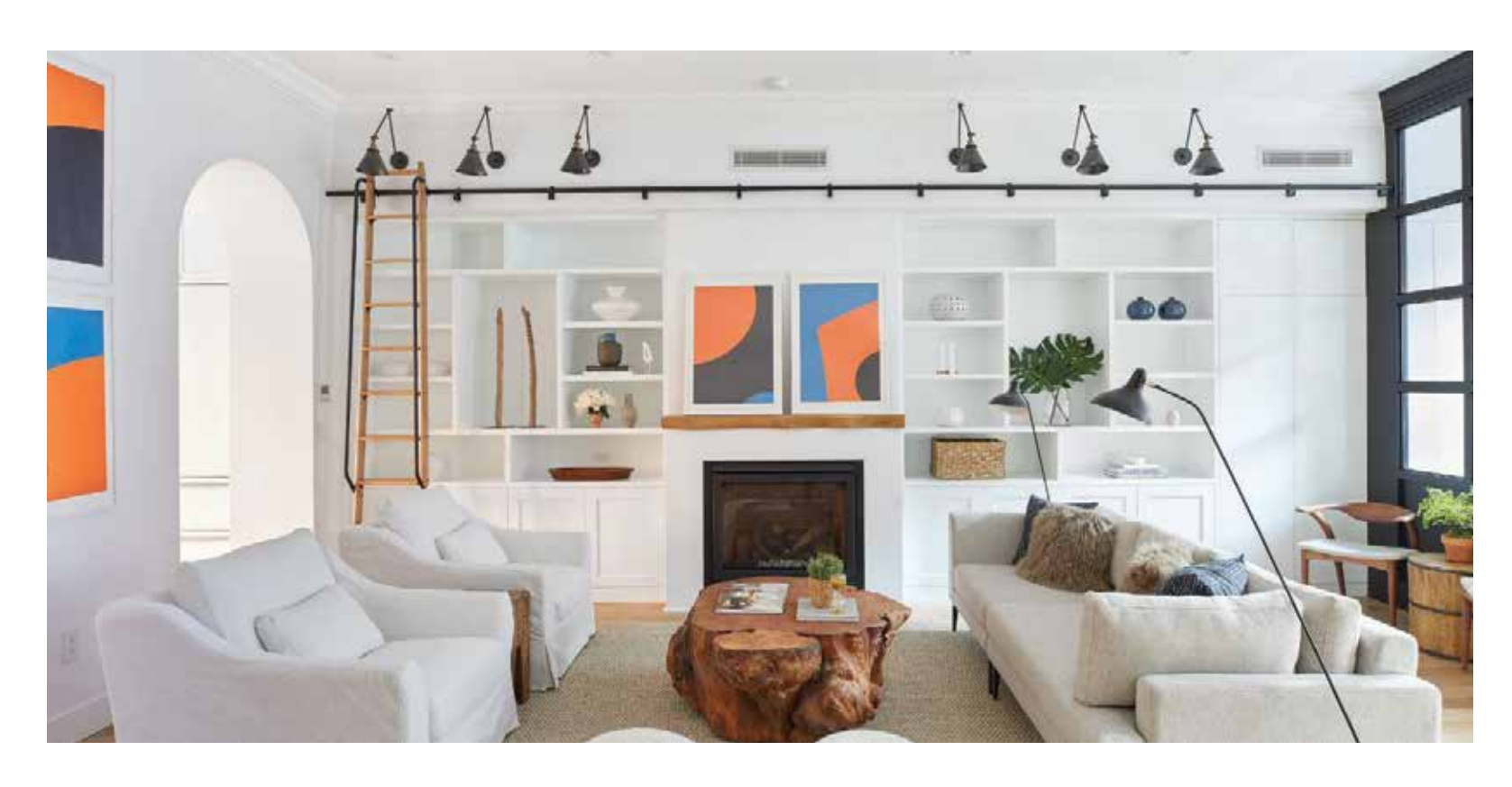
JENNIFER OKHOVAT Realtor®

Investing in physical improvements to a home can increase its sale price dramatically, but many clients aren't able to spend that money. With Compass Concierge, I can now fund the cosmetic services that will increase the value of your property--staging, repairs, deep cleaning, landscaping-and when your home sells, you'll simply add that amount (and nothing more) to the commission.