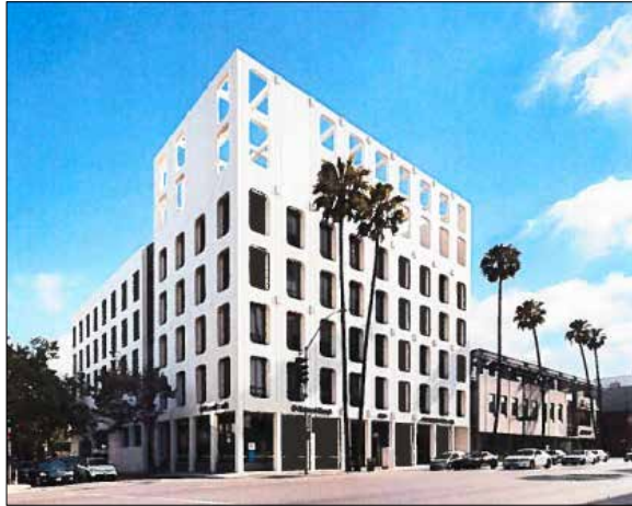
9300 Wilshire Boulevard

The City Council voted last Tuesday to formally place two new properties on the Beverly Hills Register of Historic Properties, the Wilshire-Rexford Office Building located at 9300 Wilshire Boulevard and the David O. Selznick Residence at 1050 Summit Drive. The addition of the