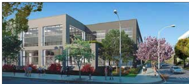
Rendering of 325 North Maple Drive

The Beverly Hills-based event promotion company Live Nation Entertainment