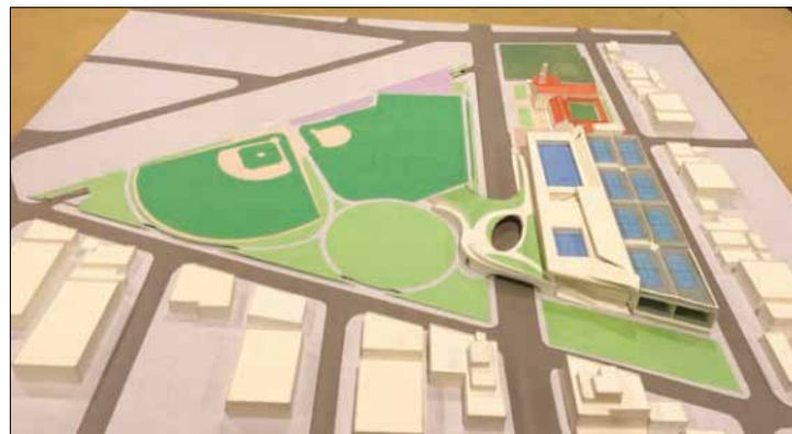
La Cienega Park rendering

Plans for renovating La Cienega park are well underway following months of discussion and several town hall meetings related to what should be included in a complete “recreation complex.” Ideas have so far included a 30,000 square foot recreation center, indoor basketball courts, and a 25,000 square foot