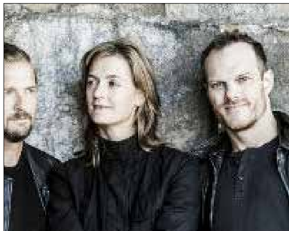
The Tetzlaff Trio

The Wallis Annenberg Center for the Performing Arts will present The Tetzlaff Trio performing Schumann's consummate "Trio No. 1 in D minor, Op. 63," paired with Dvořák's remarkable master-