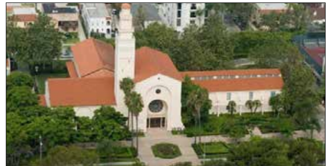
The Academy of Motion Picture Arts & Sciences’ Margaret Herrick Library