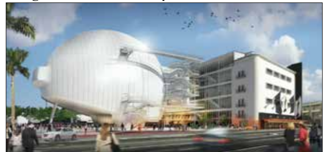
Rendering of upcoming rotating exhibits at the old May Company building on Wilshire.