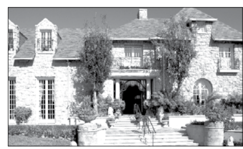
1100 Carolyn Way.

The property was formerly known as Shadow Hall, and is now better known as Grayhall. Over the years, the property has undergone some modifications including the removal of the original rustic wooden