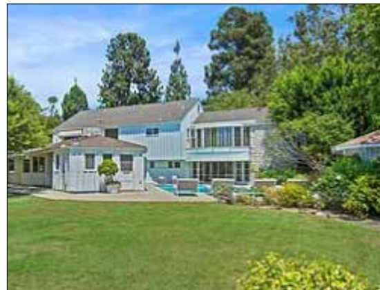
959 Alpine Drive