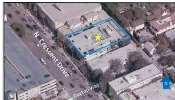
310 North Crescent Drive

The permit was approved by the planning commission on December 10, 2015 and was valid for an initial period of three