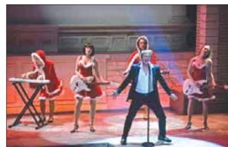
Rex Smith as Billy Mack

are subject to change. To purchase tickets and for more information, visit TheWallis.org/Love .