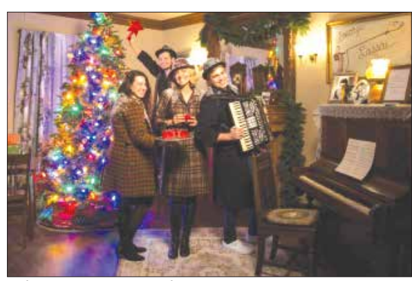
The Scenario Studio